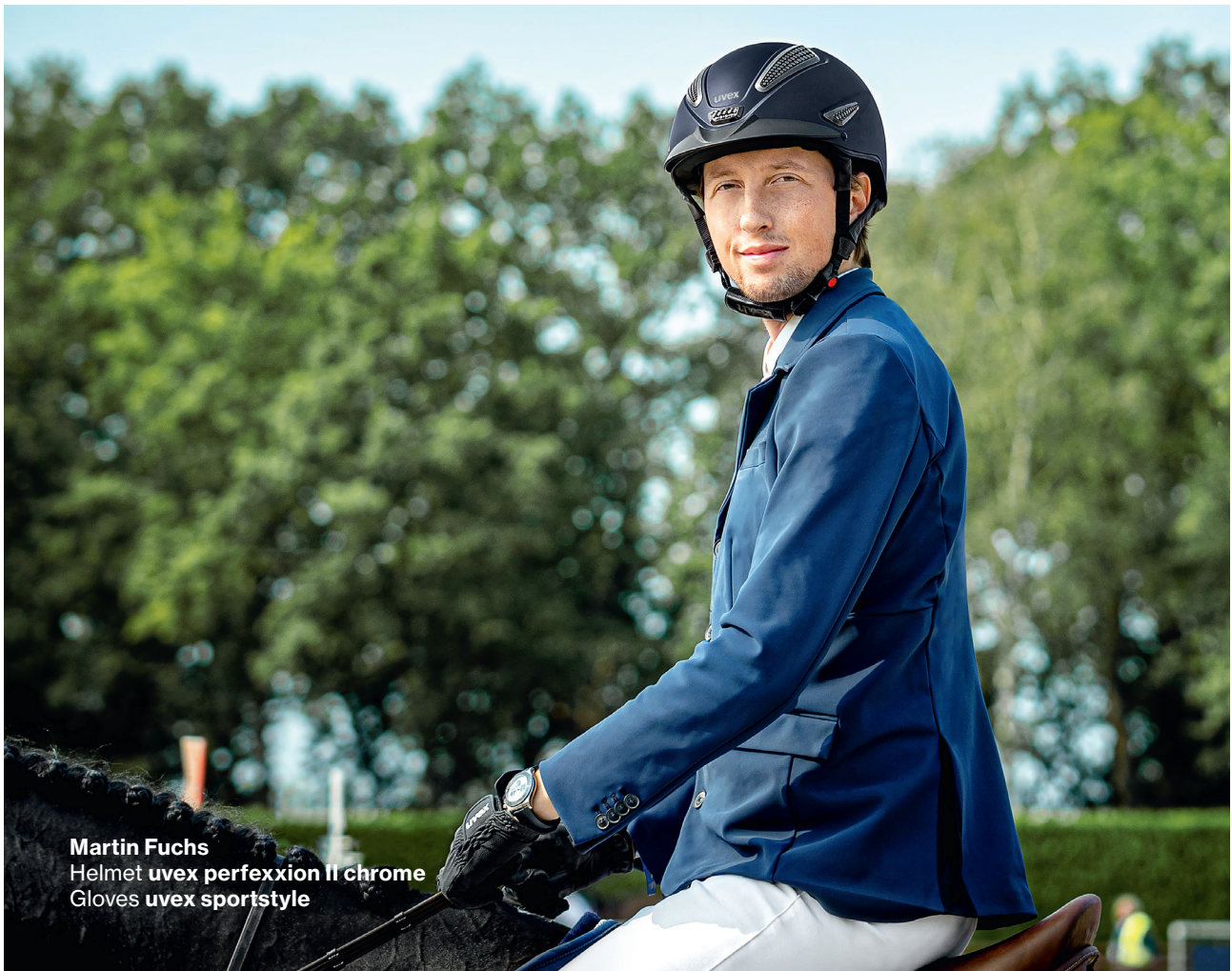
Martin Fuchs Helmet uvex perfexion II chrome Gloves uvex sportstyle